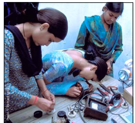
Girls in India learn electrical repair through the Better Life Options Program.