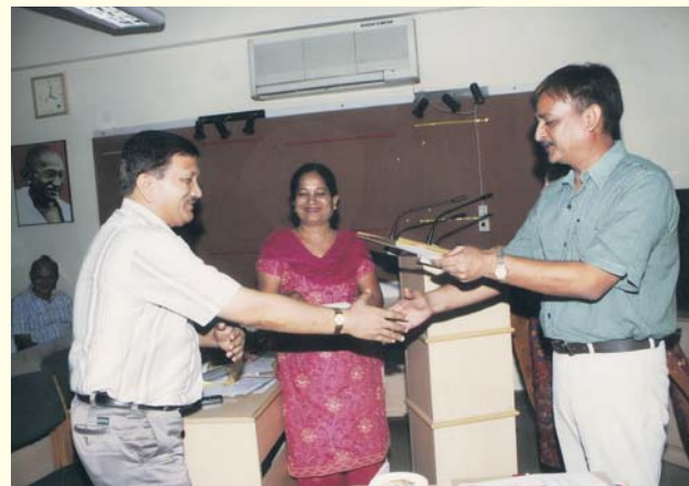
A view of celebration of Hindi Pakhwara at the Headquarters at New Delhi

The Institute has a Hindi Section in existence since 1980 which monitors the use of Hindi with respect to various constitutional and legal provisions of Official Language Act, 1963. This section is actively involved in promotion of use of Hindi at Headquarters and its Regional Centres. It also provides required support to the training and other programme divisions in translation of training material, various proforma besides providing guidance in use of Hindi from time to time. During the year activities of Hindi Section included translation of Annual Report, Annual Audit Report, course designs/brochures of various programmes and translation of various other material/