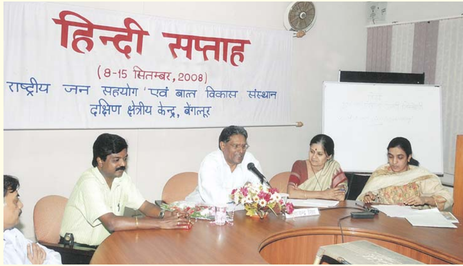
A view of celebration of Hindi Pakhwara at Regional Centre Bangalore