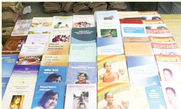
Publications of NIPCCD