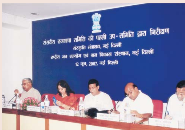
Meeting of the Sub Committee of the Parliamentary Committee on Official Language Committee

With a view to implementing various constitutional and legal provisions of Official Language Act, 1963, the Institute set up a Hindi Section in 1980. This section is actively involved in the promotion of use of Hindi at its headquarters and Regional Centres. It also provides required support to the training and other programme divisions in translation of training