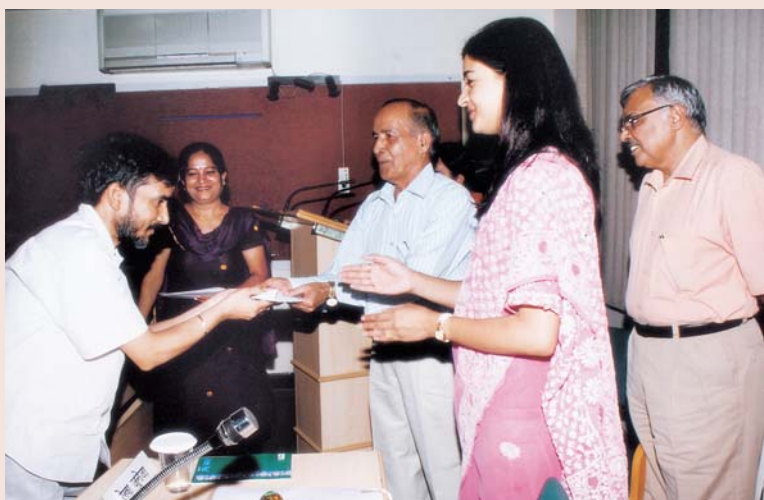
A view of celebration of Hindi Pakhwara